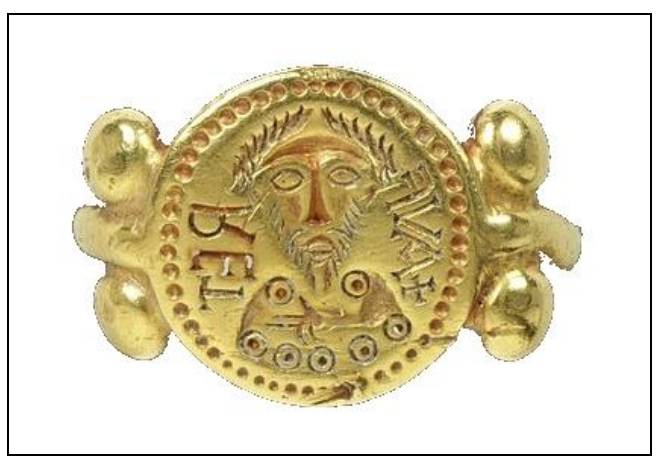
Figure 3. Ring seal of Aufret.

For a long period the rings seal was wrongly estimated bellowing to Alfred the Great, the Saxon King of England who lived in 9<sup>th</sup> century. Finally Lusuardi Siena, Kurze and Gannon wrote the true history [8, 9] and at present the precious jewel can be admired in the Victoria and Albert Museum in London, where was present since 1871 (Figure 3).