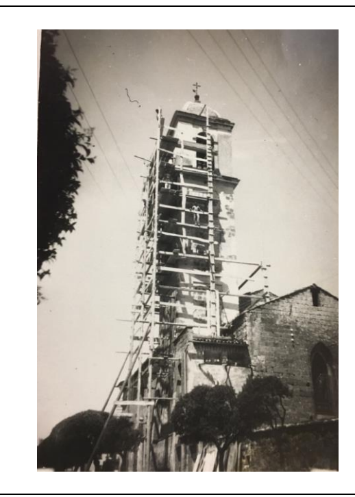
Figure 6. Restoring works of the ancient Church of SS. Annunziata in Bagnoregio, by Nello Gentili (3<sup>rd</sup> generation, 1940).