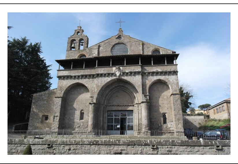
Figure 8. Restoration work in the church of Saint Flavianus in Montefiascone by Nello Gentili (5<sup>th</sup> generation, 1980).

generations of activity from father to son. These works may be found in the website of Gentili at: www.gentilirestauri.it. In the Figures 5-9 some of the most relevant activities are shown.