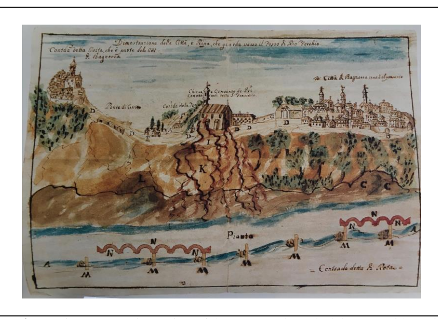
Figure 4. Drawing representing a view of the Bagnoregio and Civita area with particular reference to geomorphological instability and planned hydraulic measures. This drawing, by F. Antonini, was enclosed to the relation sent by Bagnoregio Municipality to the Sacra Congregazione del Buon Governo of Rome in 1765 [A.C.B. Liber consiliorum , c. 19t,15/12/1765].

Building Company in 1863 at present Gentili SRL Company, belonged to this Society.