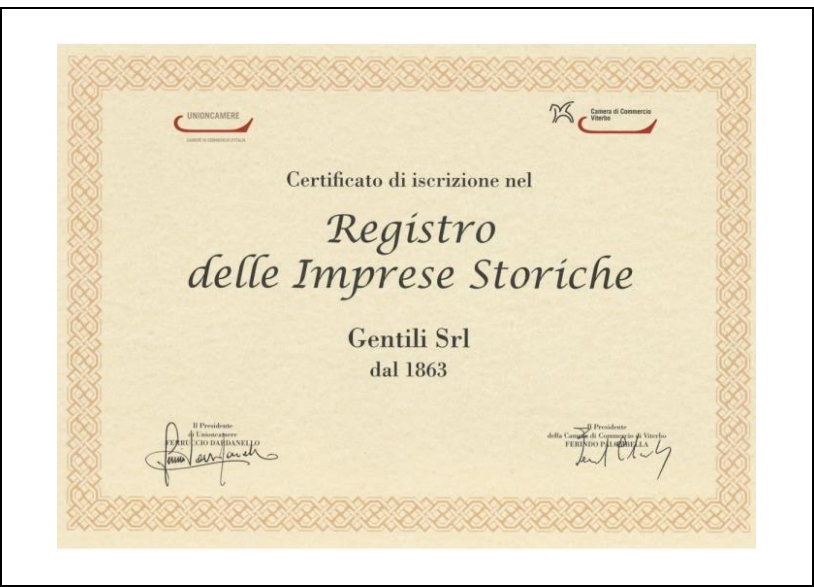
Figure 1. Inscription certificate in the Registry of Historical Italian Enterprises.

years later (in 604 AD) the village was called BALNEUS REGIS by Paulus Diaconus in his Historia Longobardorum [7].